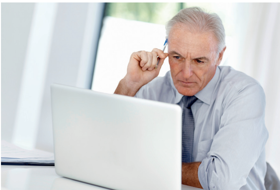
Are you leaving money on the table for no reason?

A re you leaving money on the table for no reason? You are if you manage the business at a service provider and are not offering broadband Ethernet services to more business customers. In fact, high-speed, high-performance, and highly available Ethernet services are essential to satisfy one of your largest and fastest-growing sources of future demand: the small- to medium-size enterprise (SME) customers.