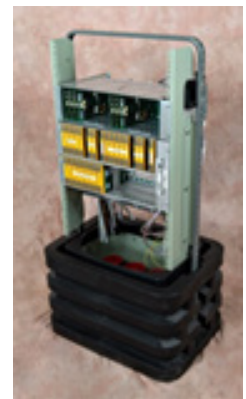
NeXa Broadband Connect Large Enclosure. Up to 300 pair distribution cable and 100 ABA/VBA ports in one integrated enclosure

The NeXa BBA Connect solution is supplied pre-packaged in an approved channel enclosures which is remotely powered and fit into existing right-of-way. This makes the solution easy to install and deploy. This new solution enhances bandwidth and provides more efficient work procedures at a fraction of the cost of adding fiber and new DSLAMs.