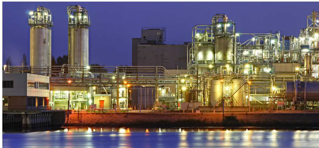
Video cameras may be part of an automated surveillance system programmed to trigger alarms upon detection of an intrusion at night.

For some sites, such as university campuses, video cameras need to be unobtrusive and deployed subliminally for invocation at times of crisis as part of an overall security solution, but not to monitor students moving freely as part of their everyday educational and social activities. At municipal and commercial sites, for example, video cameras may be part of an automated surveillance system programmed to trigger alarms upon detection of an intrusion at night. In another scenario, video surveillance may be used to augment existing physical control over access through doors and gates to critical areas of a water treatment plant, refinery, even college dormitories. These different scenarios call for distinct solutions, but with common requirements: they must be cost effective, easy to use, easy to install everywhere, and highly reliable. Video surveillance solutions struggle to meet all of these different requirements, especially when taking cost into consideration. Additionally, vendors have found it extremely difficult to integrate existing solutions into their access control systems.