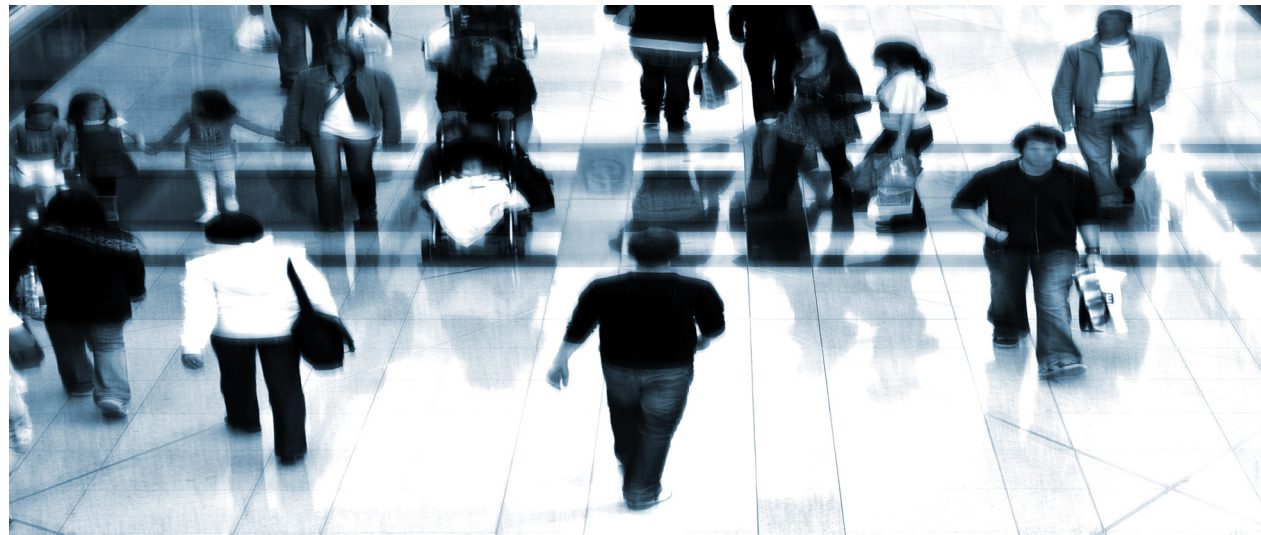
Video surveillance monitors criminal behavior, prevents accidents, and can save lives.

In the end, the message to customers is that video surveillance cameras can now be widely deployed without the need to run fiber or coax, and they can be used successfully through intuitive displays that allow operators to flick between cameras that provide streaming video and/or snapshots of a location or multiple sites. From an economics viewpoint, by leveraging existing assets capital and operational expenditures are greatly reduced while a quick ROI is achievable in just a few months. But perhaps the most important value proposition is the added security, safety, and confidence the combined Actelis-IVC solution delivers. After all, a reliable video surveillance system is ultimately about preventing accidents, saving lives, and squashing criminal behavior—activities no one wants to experience or can afford.